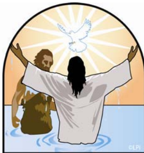
Baptism of the Lord

The Feast of the Baptism of the Lord closes the Christmas Season. Jesus' Baptism points to the significance of our Baptism, our sacramental dying and rising with Jesus in the waters of Baptism so that we can all share life in the Spirit. It is true that "Baptism makes us members of the Church". Today, that's the most common way we speak of this sacrament. But if we expand or unpack the meaning of this "membership", and reflect on the spiritual reality of dying and rising with the Lord and living in the Spirit...the richness and fullness of meaning is almost mind-boggling. It definitely no longer is a matter of "do I have to go to Church on Sunday"? It simply changes and colors everything about the way we relate to the world and enter into life.